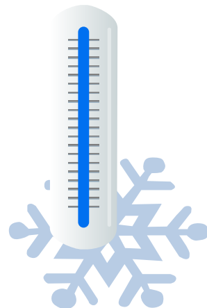
Cold [kəʊld] 冷 [lěng]