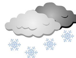
Snowy ['snoɪ] 下雪 [xià xuě]