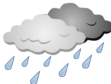
Rainy ['reni] 下雨 [xià yǔ]