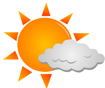
Cloudy ['klaʊdi] 多云 [duō yún]