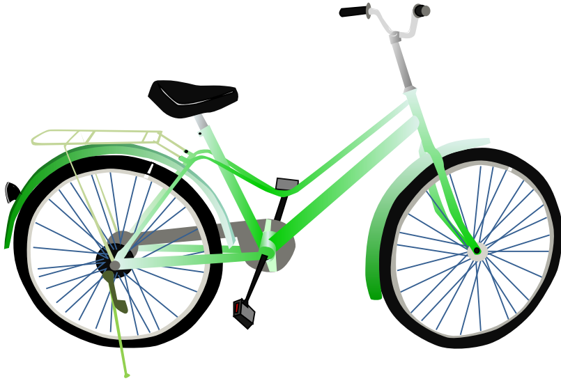
□□□ [zì xíng chē] - bicycle