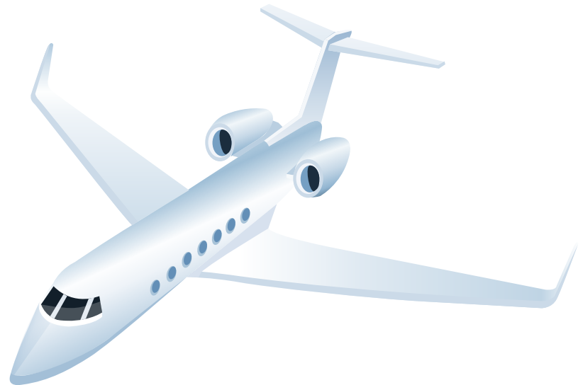
□□ [fēi jī] - airplane