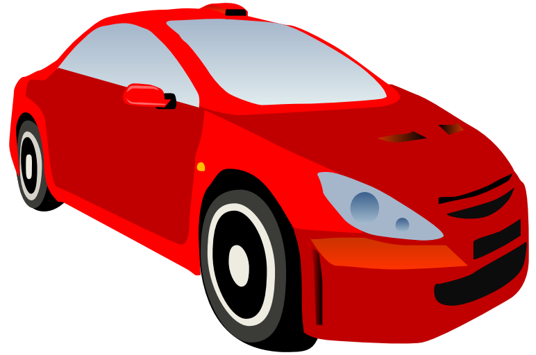
□□□ [xiǎo jiào chē] - car