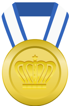
Gold Medal [gəʊld] [ˈmed(ə)l]