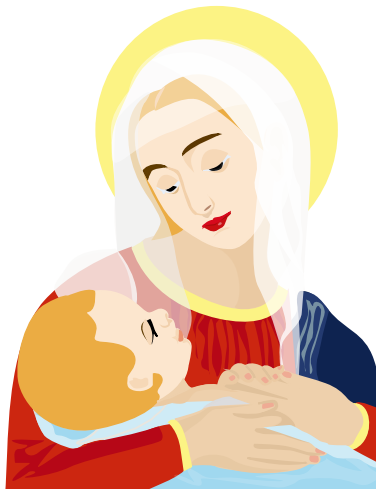
Blessed Virgin Mary