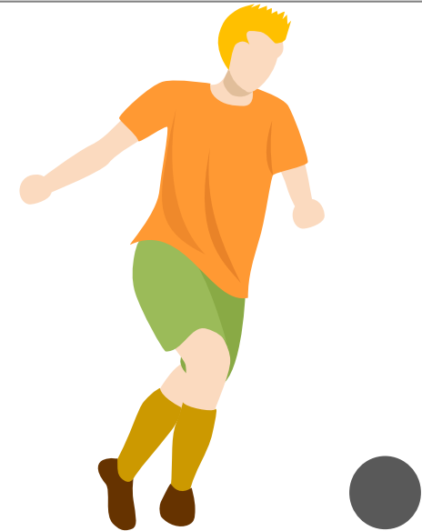
Footballer ['fʊt,bɔ:lə] 足球运动员 [zú qiú yùn dòng yuán]