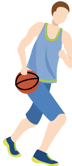
Hoopman ['hu:pməŋ] 篮球运动员 [lán qiú yùn dòng yuán]