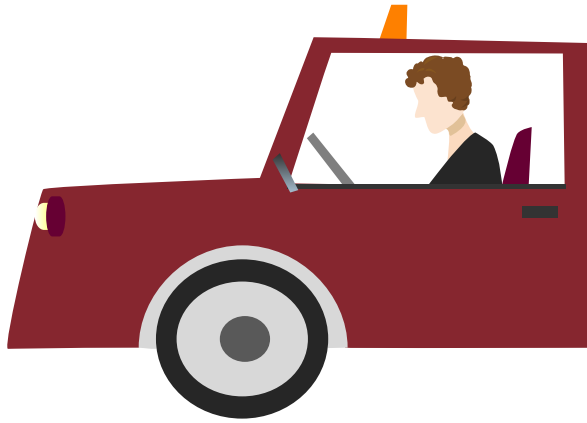
Driver ['draɪvə] 司机 [sī jī]