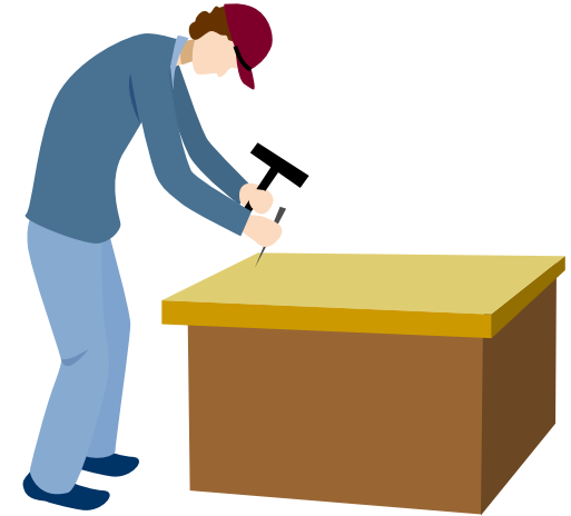
Repairman [rɪ'peəməŋ] 修理工 [xiū lǐ gōng]