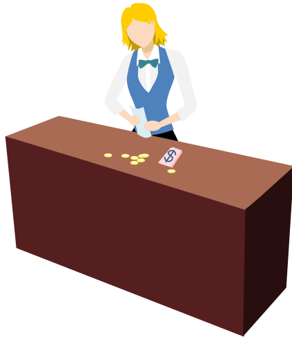
Accountant [ə'kaʊnt(ə)nt] 会计 [kuài jì]