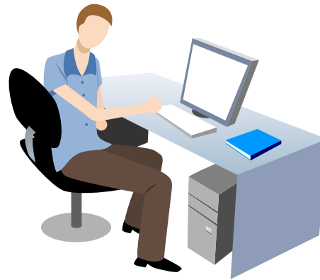
Programmer ['prəʊgræmə] 程序员 [chéng xù yuán]