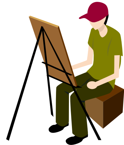
Artist ['ɑ:tɪst] 艺术家 [yì shù jiā]