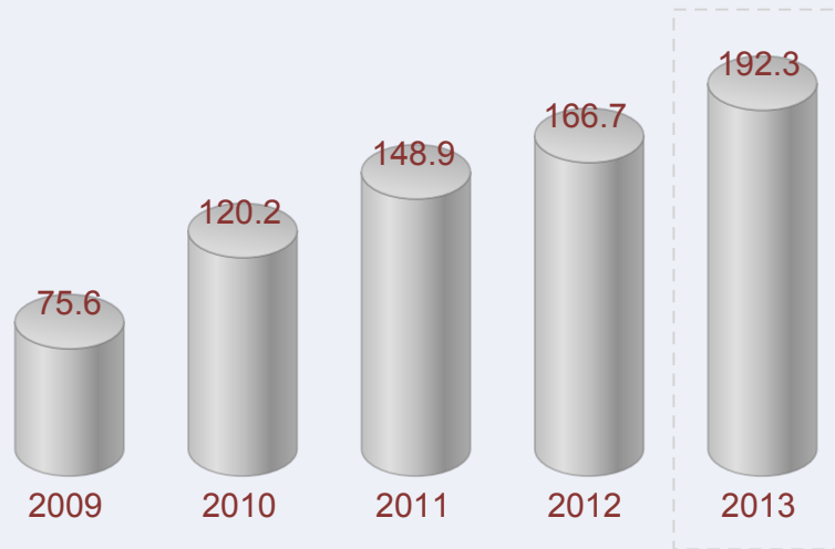
Country A Market Trends (Thousand million)