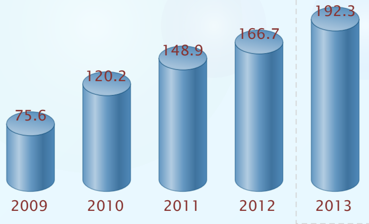
Country A Market Trends (Thousand million)