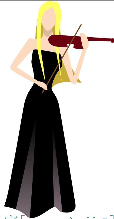
音乐家[yīn yuè jiā] - musician