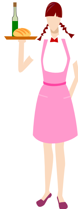
女服务员[nǚ fú wù yuán] - waitress