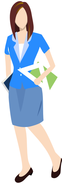
老师[lǎo shī] - teacher